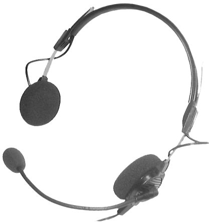
Airman 750 Shown